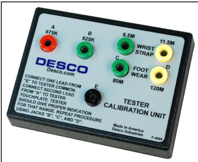
Figure 3. Desco 07010 Calibration Unit

View technical bulletin TB-2039 for more information.