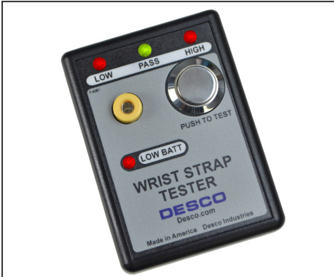
Figure 1. Desco 19240 Portable Wrist Strap Tester