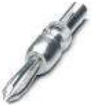
Test plugs, Color: silver