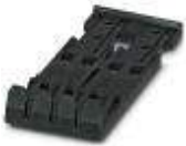
Strain relief, Number of positions: 4, Color: black