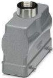
HEAVYCON B24 sleeve housing, for double locking latch, height: 76 mm, with 1 x Pg21 gland, straight cable outlet

Please be informed that the data shown in this PDF Document is generated from our Online Catalog. Please find the complete data in the user's documentation. Our General Terms of Use for Downloads are valid ( http://phoenixcontact.com/download )