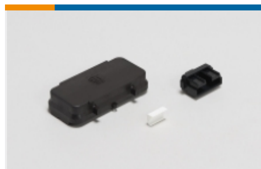
Rectangular Caps & Covers(4)