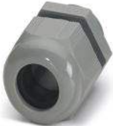
Cable gland, Cable gland material: Polyamide 6, External cable diameter 5 mm ... 10 mm, Shielding: No, Connecting thread: Pg11

Please be informed that the data shown in this PDF Document is generated from our Online Catalog. Please find the complete data in the user's documentation. Our General Terms of Use for Downloads are valid ( http://phoenixcontact.com/download )