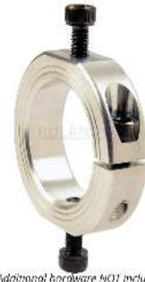
*Additional hardware #101 included