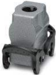
HEAVYCON sleeve housing B10, with double locking latch, height 72 mm, with thread 1x M25, straight conductor exit

Please be informed that the data shown in this PDF Document is generated from our Online Catalog. Please find the complete data in the user's documentation. Our General Terms of Use for Downloads are valid ( http://phoenixcontact.com/download )