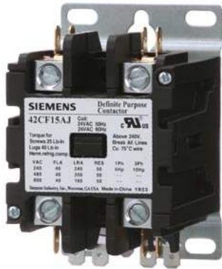
Contactor, 42DP,40A,2P,Open,277 Contactor, 42DP,40A,2P,Open,277