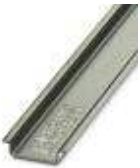
DIN rail, material: Steel, unperforated, height 7.5 mm, width 35 mm, length: 2 m

DIN rail - NS 35/ 7,5 UNPERF 2000MM - 0801681