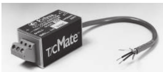
Standard T/CMate Model 200 has 165 mm (6.5") cable with soldered ends for terminal block or other connection.