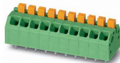
The figure shows 10-pos. standard item (without EX marking)

PCB terminal block, Push-in spring connection