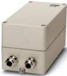
Housing for mounting surge voltage arresters

Please be informed that the data shown in this PDF Document is generated from our Online Catalog. Please find the complete data in the user's documentation. Our General Terms of Use for Downloads are valid ( http://phoenixcontact.com/download )