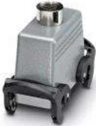
HEAVYCON sleeve housing B16, with double locking latch, height 65 mm, with support 1x M25, straight conductor exit

Please be informed that the data shown in this PDF Document is generated from our Online Catalog. Please find the complete data in the user's documentation. Our General Terms of Use for Downloads are valid ( http://download.phoenixcontact.com )