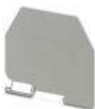
Separating plate, Length: 99 mm, Width: 2 mm, Height: 90 mm, Color: gray