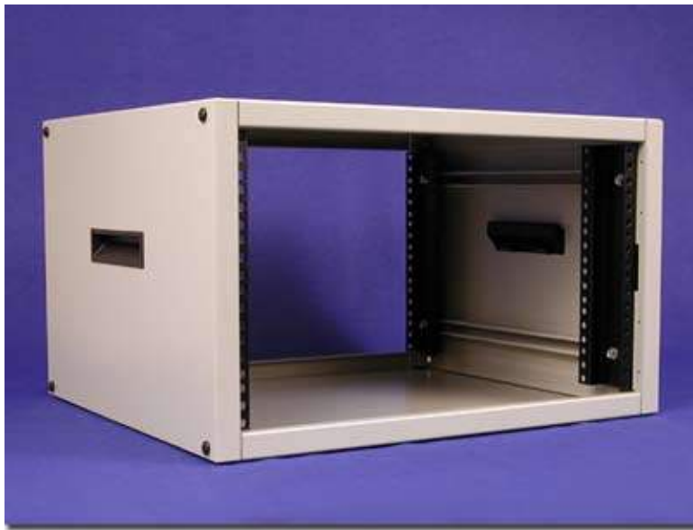
Light Gray (Textured)