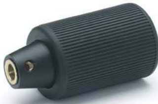
ELESA Original design

Fit the handle onto slight chamfered shaft end and push as far as possible by hand or by means of a small press. Alternatively it is possible to tap the handle with a plastic or wooden mallet until firmly in place. In this case we strongly recommend to use a cloth or other suitable soft material over the product to avoid any surface damage.