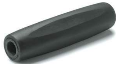
ERGOSTYLE® ELESA Original design