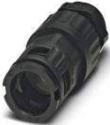
Cable gland, Pg thread, IP68/69k protection, with strain relief

Please be informed that the data shown in this PDF Document is generated from our Online Catalog. Please find the complete data in the user's documentation. Our General Terms of Use for Downloads are valid ( http://phoenixcontact.com/download )