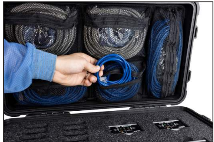
Figure 2. Using the the lid organizer to store accessories

Per ANSI/ESD S20.20 section 6.1.3.1 Compliance Verification Plan Requirement “A Compliance Verification Plan shall be established to ensure the organization’s compliance with the requirements of the Plan. Formal audits or certifications shall be conducted in accordance with a Compliance Verification Plan that identifies the requirements to be verified, and the frequency at which those verifications must occur. Test equipment shall be selected to make measurements of appropriate properties of the technical requirements that are incorporated into the ESD program plan.”