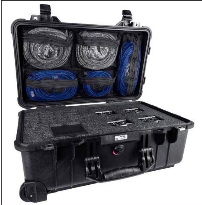
Figure 1. SCS 770052 Workstation Diagnostic Kit