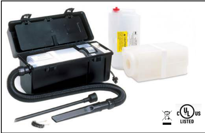
Figure 1. 497AJK HEPA Vacuum .