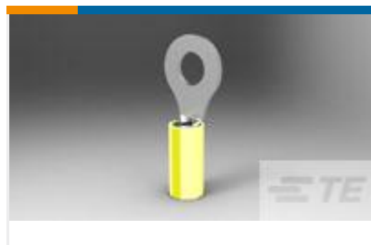
TE Part #2-320569-5 TERMINAL,PIDG R IR 12 1/4