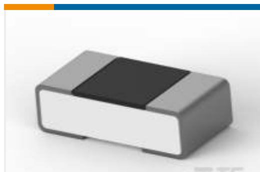
TE Part #5-2176362-2 RQ 0402 137R 0.1% 10PPM 5K RL