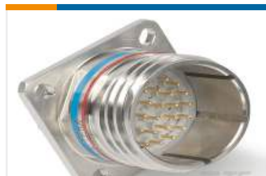
TE Part #YDTS20W21-11PNV001 RECP ASSY