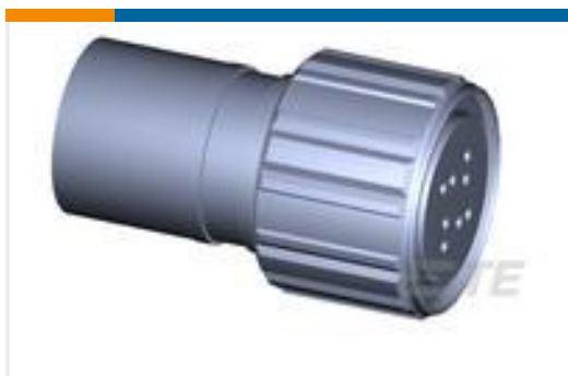
TE Part #2102353-4 CeeLok FAS-T, Plug Kit, ZnNi, A