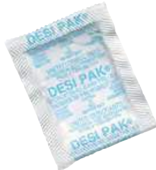
48880 & 48883