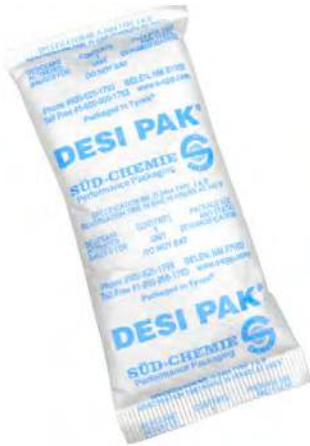
48887 & 48888

In order to provide a complete moisture barrier packaging assembly, desiccant must be inserted into the bag, prior to having the bag vacuum sealed. The recommended amount of desiccant is dependent on the interior surface area of the bag to be used. Figure 4 is a reference table indicating recommended minimum amounts of desiccant that should be used with Moisture Barrier Bags.