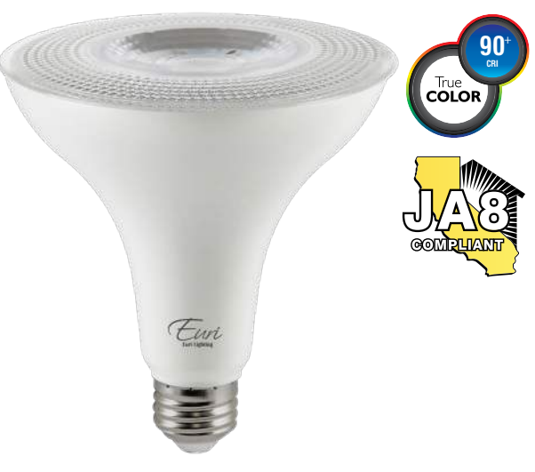
Available only as a twin-pack.