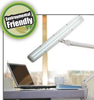
Control panel for power on/off and lighting adjustment

A good working light makes your job more efficient and comfortable.