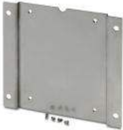
Mounting plate for FL SWITCH 30... and FL SWITCH 40... eight-port switches

Please be informed that the data shown in this PDF Document is generated from our Online Catalog. Please find the complete data in the user's documentation. Our General Terms of Use for Downloads are valid ( http://phoenixcontact.com/download )