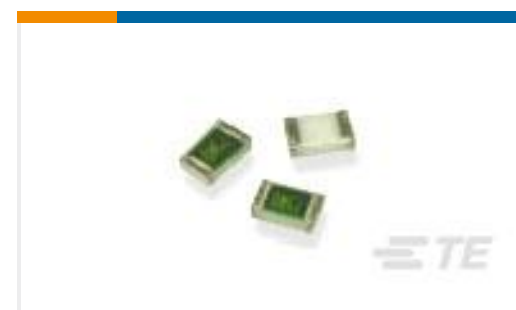
TE Part #1676174-5 RN 0805 12K7 0.1% 10PPM CUT LENGTH