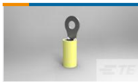
TE Part #7-1377173-7 SMP 0-0035108-0