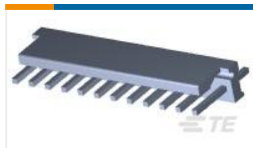
TE Part #1-644752-2 12P MTA156 HDR ASSY SQ STR F/L