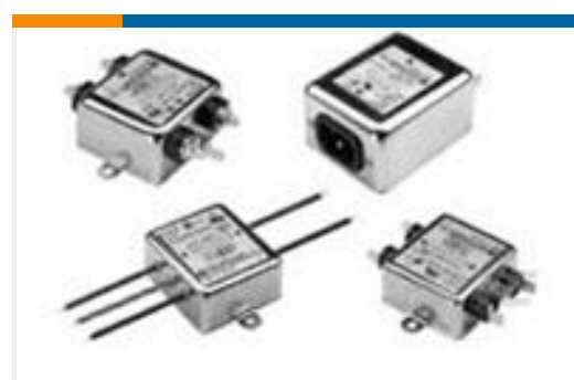
TE Part #6609028-3 2VK1=F7133 S0