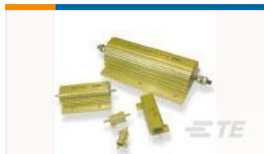
TE Part #5-1625971-7 HSA25 560R 5%