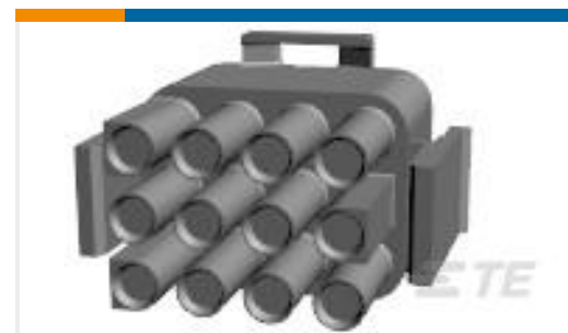
TE Part #1586848-1 12P UMNL PLUG HSG, GW