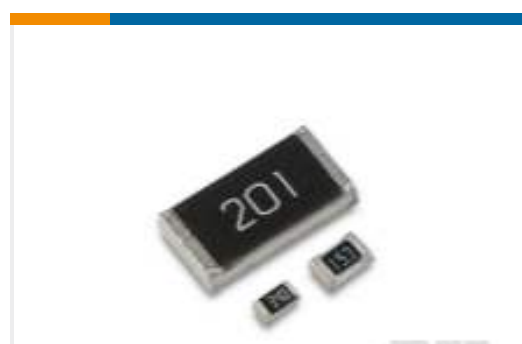
TE Part #1-2176327-9 CRGP 0805 330R 1%