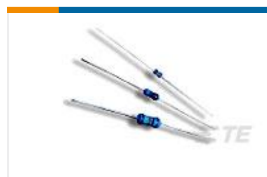
TE Part #1622537-5 LR1 1% 604R