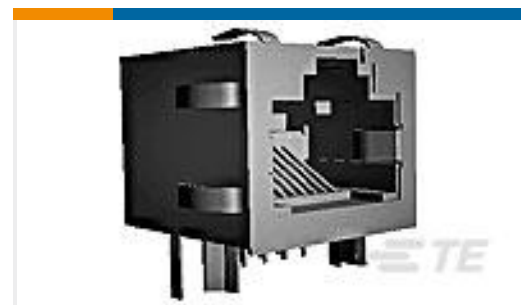
TE Part #2-406541-3 MJ,INV,1X1,6PNL G.,.100"ST,SN, NARROW POST