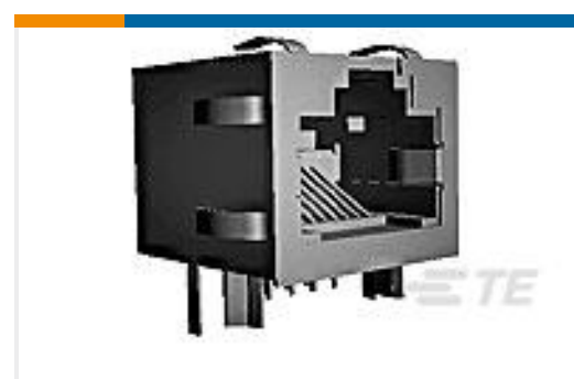
TE Part #6364288-1 INV MJ,1X1,PNL GRD,RJ11BLOCK,BLK