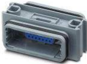
D-SUB coupling, shell size 2, socket, gender changer, shielded, connection direction straight, IP67 degree of protection

Please be informed that the data shown in this PDF Document is generated from our Online Catalog. Please find the complete data in the user's documentation. Our General Terms of Use for Downloads are valid ( http://download.phoenixcontact.com )