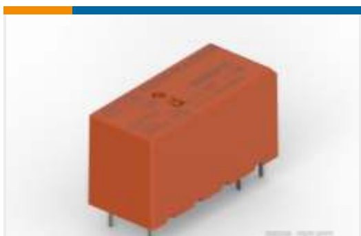
TE Part #2158000-7 RZH3-1A4-D006