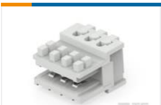
TE Part #2402726-3 Same as 284930-3 w/ alternative resin