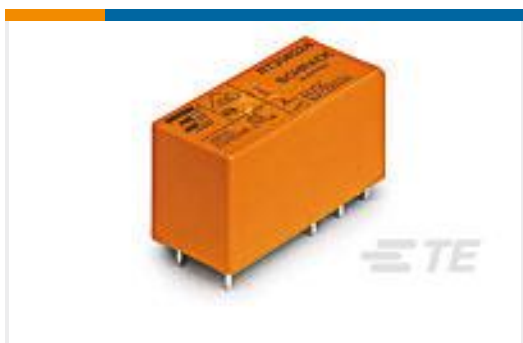
TE Part #1393240-1 RT314048