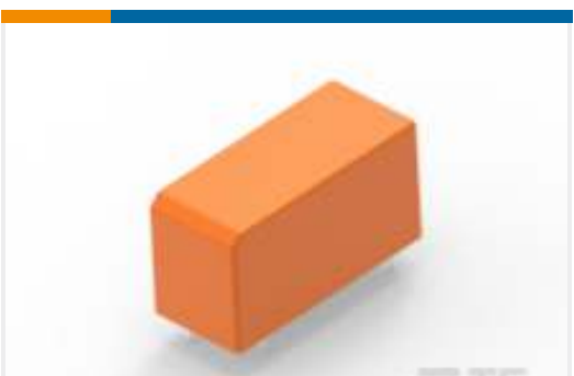
TE Part #5-2158000-3 RZ03-1A4-D012-EX1