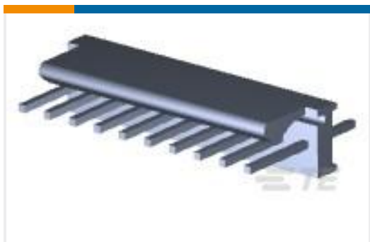
TE Part #1-640456-0 10P MTA100 HDR ASSY F/L SQ STR