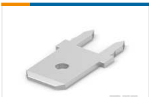
TE Part #1-63986-1 250 FASTON,PCB TAB,BR