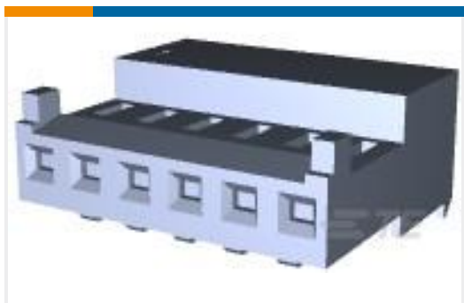
TE Part #3-643813-6 06P MTA100 CONN ASSY POL RIB