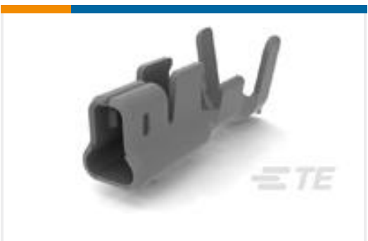
TE Part #2110989-1 EP 2.5 RCPT CONTACT, 26-22 AWG