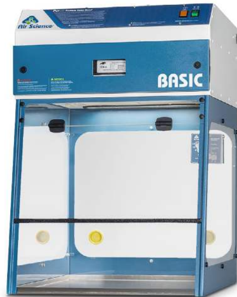
Purair ® P5-24-XT