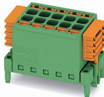
The illustration shows the 5-pos. version

Plug component, Push-in spring connection