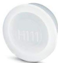
Plastic protection cap for connectors with M23 knurled nut

https://www.phoenixcontact.com/us/products/1604223