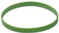
Color-coding, color: green

https://www.phoenixcontact.com/us/products/1620588