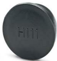
Plastic protection cap, antistatic, for connectors with M23 knurled nut

https://www.phoenixcontact.com/us/products/1611796