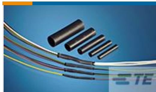
TE Part #CH03596001 QSZH-125-NR3-45MM