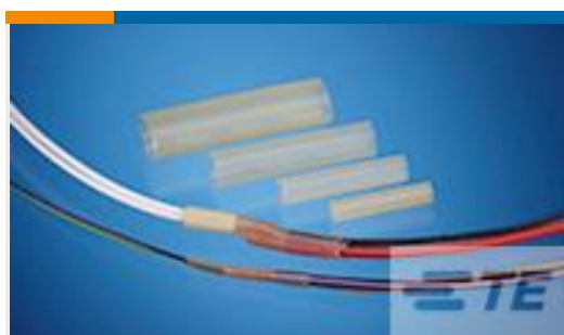
TE Part #3257456008 RBK-VWS-125-NR2-X-25MM