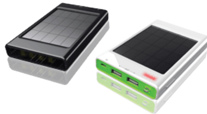
Components in Package : SLPD-01 + USB cable + Product Manual

Solar Charge Battery Pack Quick Smart Charge Flashlight