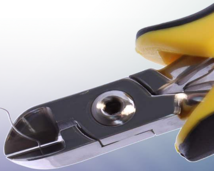
Tungsten Carbide Blades 79-80 HRC

Aven's Tungsten Carbide Oval Head Cutters are designed to cut through hard wires with ease. The tungsten carbide blades have a hardness rating of 79-80 HRC for exceptional durability. Applications include Guide Wires, Stents, Catheters and Single/Multiple Fillers. Available with Flush and Semi-Flush blades.