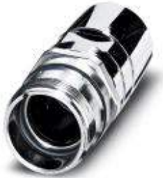
Sleeve housing for coupler connector, straight, Screw locking, M23, Shielded: No, Cable cross section: 10 mm...14 mm

Please be informed that the data shown in this PDF Document is generated from our Online Catalog. Please find the complete data in the user's documentation. Our General Terms of Use for Downloads are valid ( http://download.phoenixcontact.com )