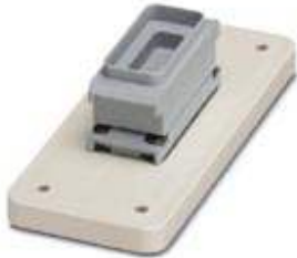
Adapter plate, size B16, reinforced, including panel mounting frame with DSUB 9 protective cover and without contact insert

Please be informed that the data shown in this PDF Document is generated from our Online Catalog. Please find the complete data in the user's documentation. Our General Terms of Use for Downloads are valid ( http://download.phoenixcontact.com )