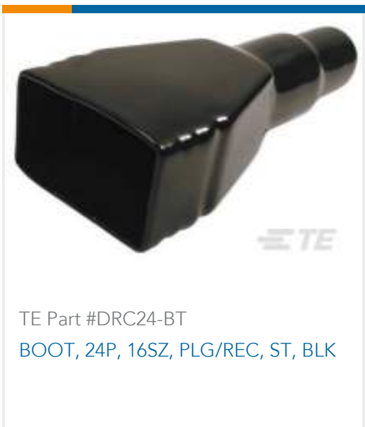
TE Part #DRC24-BT BOOT, 24P, 16SZ, PLG/REC, ST, BLK