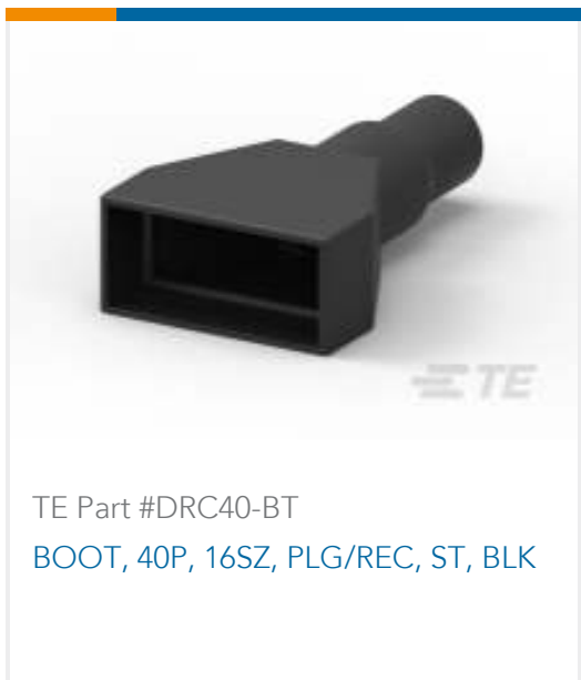
TE Part #DRC40-BT BOOT, 40P, 16SZ, PLG/REC, ST, BLK