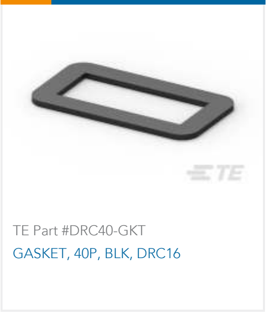
TE Part #DRC40-GKT GASKET, 40P, BLK, DRC16