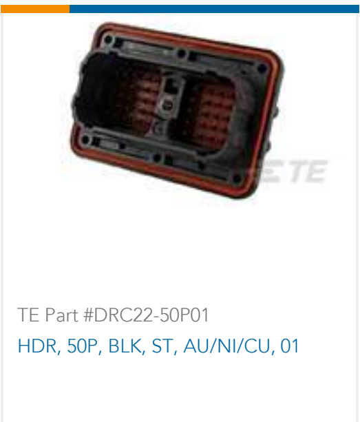
TE Part #DRC22-50P01 HDR, 50P, BLK, ST, AU/NI/CU, 01