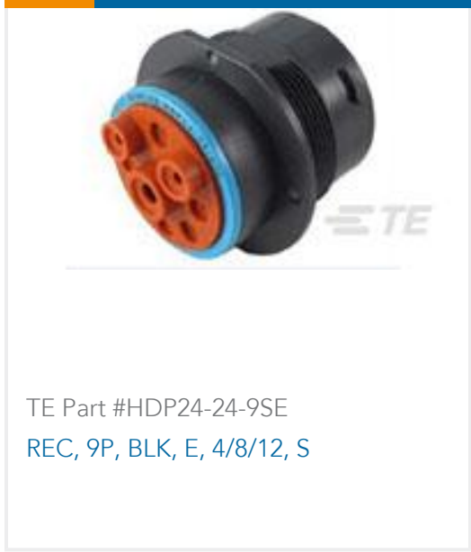
TE Part #HDP24-24-9SE REC, 9P, BLK, E, 4/8/12, S