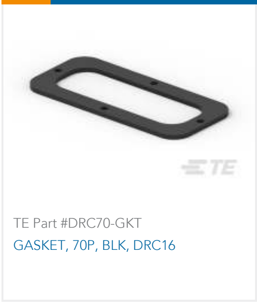
TE Part #DRC70-GKT GASKET, 70P, BLK, DRC16