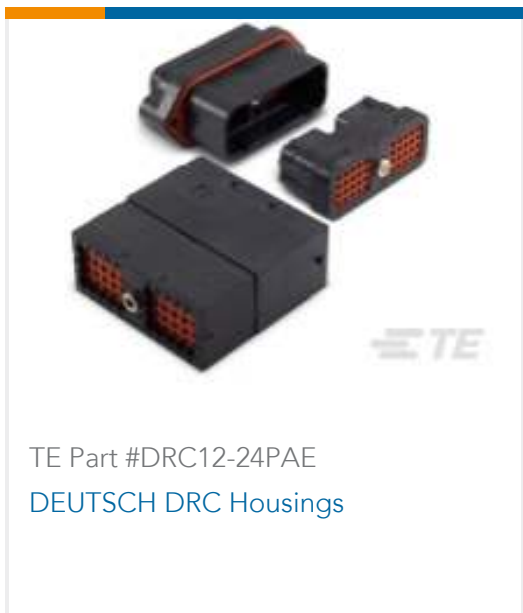
TE Part #DRC12-24PAE DEUTSCH DRC Housings