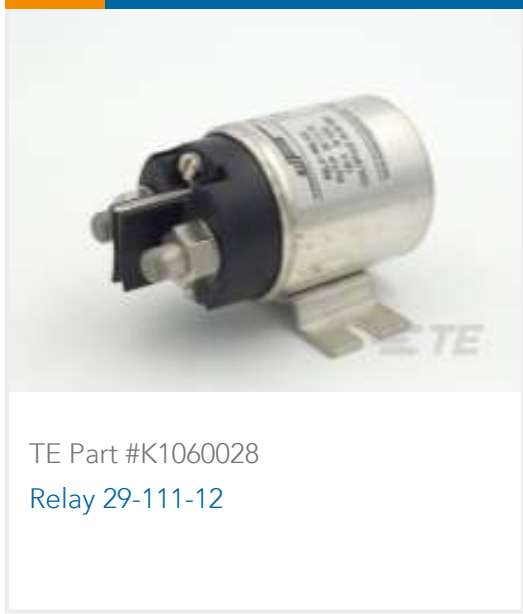
TE Part #K1060028 Relay 29-111-12