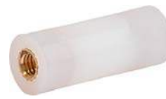
Transpillars Style 3