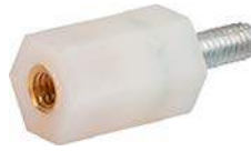
Transpillars Style 2