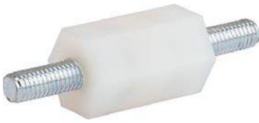
Transpillars Style 1

Transpillars, a rugged insulated mounting system