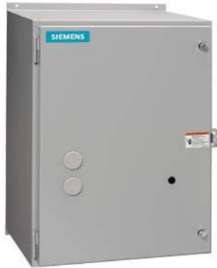
Electrically held 400Amp NEMA 4SS NON-Combination