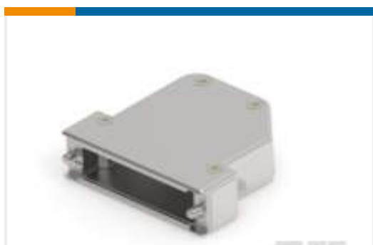
TE Part #1-2308342-1 FULL METAL HOODS SIZE 3