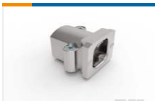
TE Part #1-2308272-1 Cable Clamp for Size 1-3 STD/1-4 QL Shell