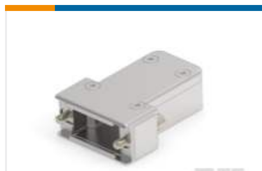
TE Part #1-2308340-1 FULL METAL HOODS SIZE 1