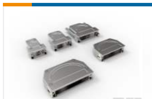
TE Part #1-2308346-1 D-SUB BACKSHELL SIZE 5