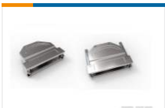
TE Part #1-2308345-5 D-SUB BACKSHELL SIZE 4