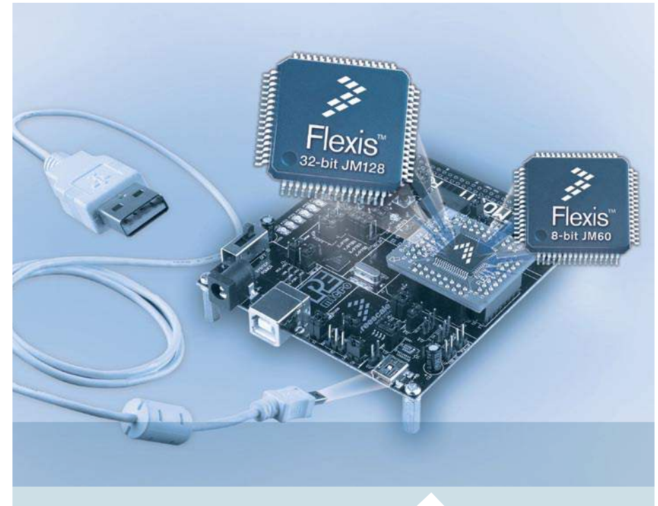
Flexis™ Microcontroller Series