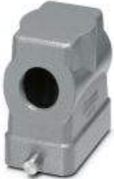
HEAVYCON sleeve housing B10, for single locking latch, height 72 mm, with thread 1x M20, lateral conductor exit

Please be informed that the data shown in this PDF Document is generated from our Online Catalog. Please find the complete data in the user's documentation. Our General Terms of Use for Downloads are valid ( http://download.phoenixcontact.com )