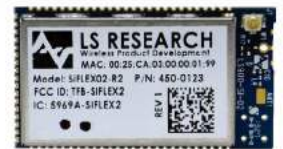
Actual size (23 mm x 41.4 mm)