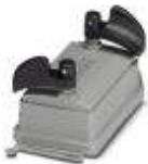
HEAVYCON ADVANCE IP65 protective cover B6, with bayonet locking, with retaining cord, diameter of retaining cord eyelet 3 mm

Protective covers - HC-B 6-TMB-SD-IP65 - 1690930