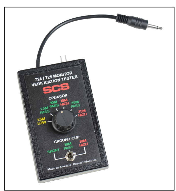
Figure 1. SCS 770065 Verification Tester