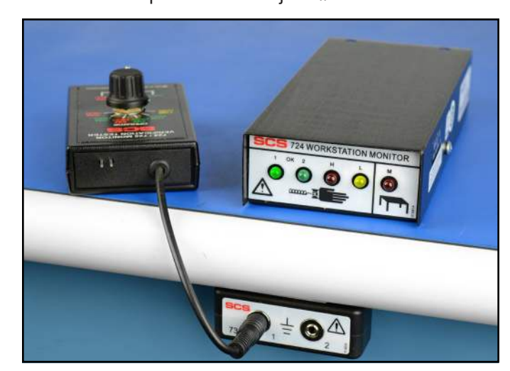
Figure 3. Using the Verification Tester with the 724 Workstation Monitor

1. Insert the Verification Tester's stereo plug into the monitor's operator remote jack #1.