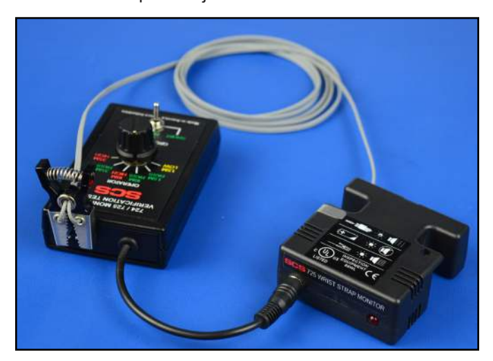
Figure 4. Using the Verification Tester with the 725 Portable Wrist Strap Monitor