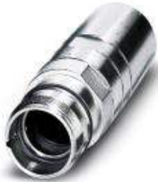
Sleeve housing for coupler connector, straight, Screw locking, M23, Shielded: Yes, Cable cross section: 6.5 mm...14.5 mm

Please be informed that the data shown in this PDF Document is generated from our Online Catalog. Please find the complete data in the user's documentation. Our General Terms of Use for Downloads are valid ( http://download.phoenixcontact.com )