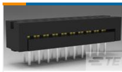
TE Part #1-746610-8 34 DIP PLUG, 100CL, LEAD FREE