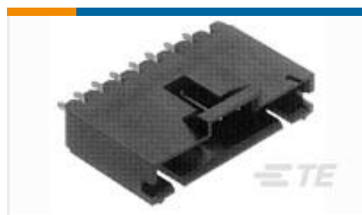
TE Part #103670-2 03 MTE HDR SRST LATCH W/HLDWN