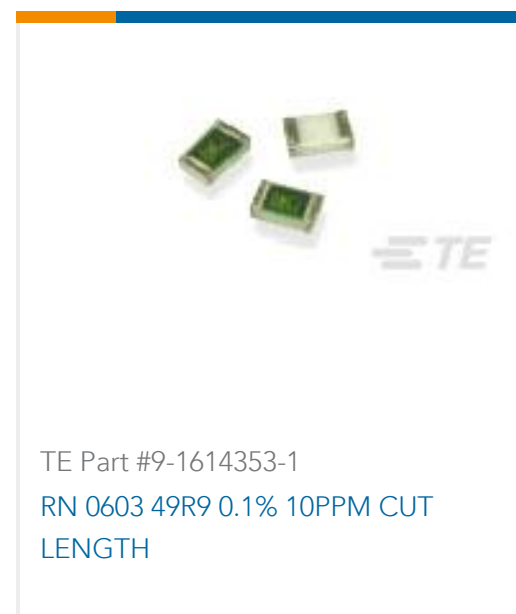
TE Part #9-1614353-1 RN 0603 49R9 0.1% 10PPM CUT LENGTH