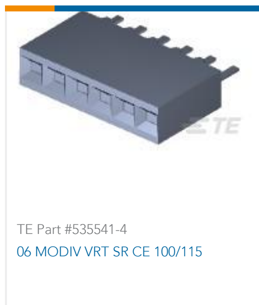
TE Part #535541-4 06 MODIV VRT SR CE 100/115