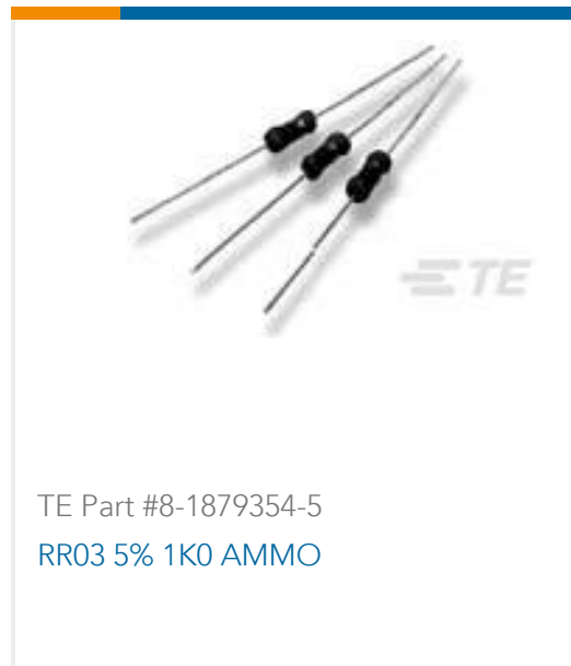
TE Part #8-1879354-5 RR03 5% 1K0 AMMO