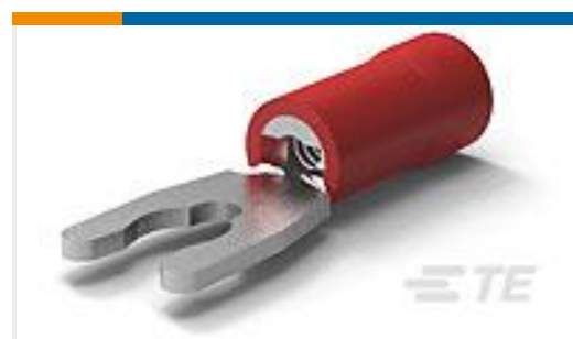
TE Part #52949 PG SPR SPD 22-16COMM 22-18MIL6