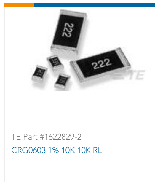
TE Part #1622829-2 CRG0603 1% 10K 10K RL