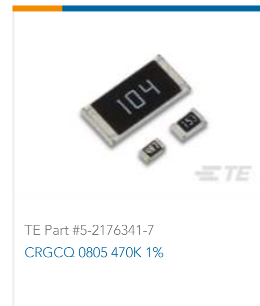
TE Part #5-2176341-7 CRGCO 0805 470K 1%