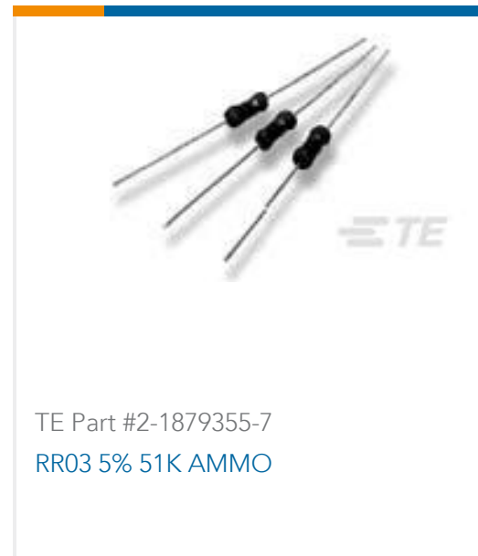
TE Part #2-1879355-7 RR03 5% 51K AMMO