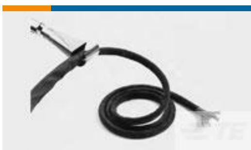
TE Part #CB7764-000 RW-200-1/8-0-SP