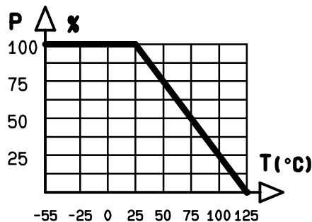
Power derating Versus temperature

Tentative data subject to change without notice