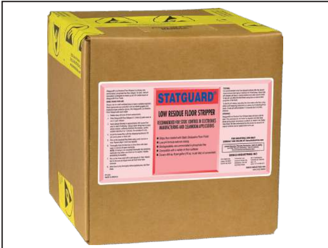
Figure 1. Statguard® Low Residue Floor Stripper