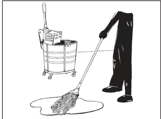
Figure 2. Applying the Statguard® Low Residue Floor Stripper with a cotton mop